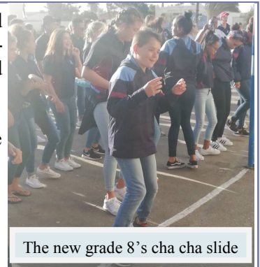
The new grade 8's cha cha slide