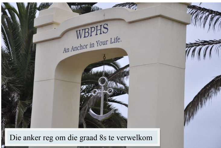
Die anker reg om die graad 8s te verwelkom

Met die klingel van ons ankerklok het 2019 se Graad 8's op 25 Januarie vanjaar hul toetrede as hoërskoolleerlinge by WBPHS aangekondig. Die Ankerseremonie is 'n tradisie wat Walvisbaai Privaat Hoërskool in 2013 ingestel het en dit peil ons leerlinge se akademiese koers tot op die laaste skooldag in Graad 12.